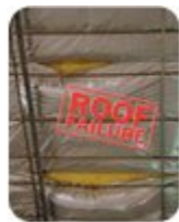
This photo from inside the rink shows ceiling insulation filled with water, with ice and water forming on the insulation facer.

Presently, we are consulting on a couple of metal roofs where the architect designed a slope of 1/4 inch per foot. The span for both roofs was 200 feet or more. Both are located in Southern England — not serious snow country for a Mainer like myself — but problems developed nonetheless.